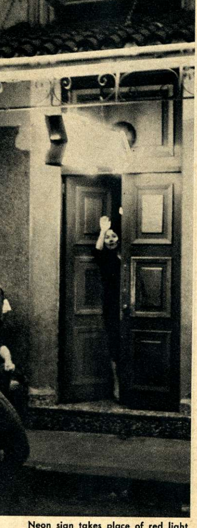
Neon sign takes place of red light.