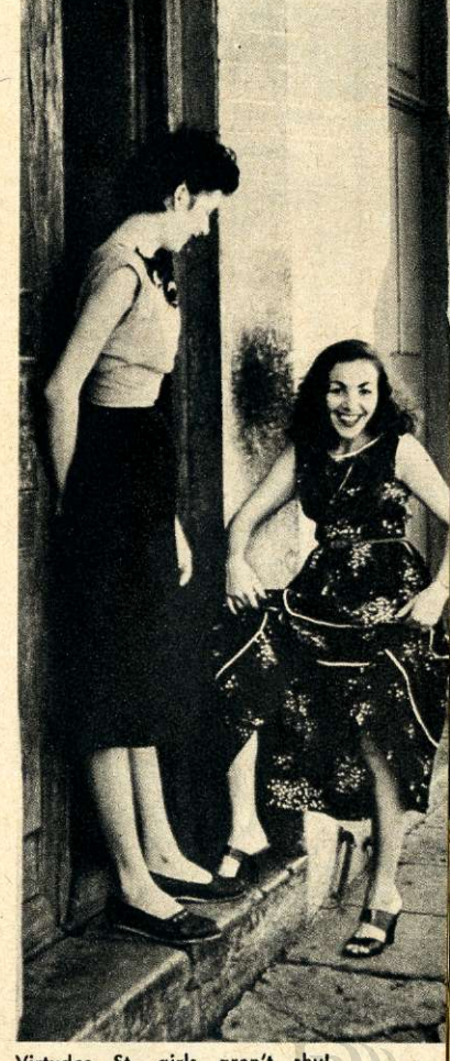
Virtudes St. girls aren't shy!