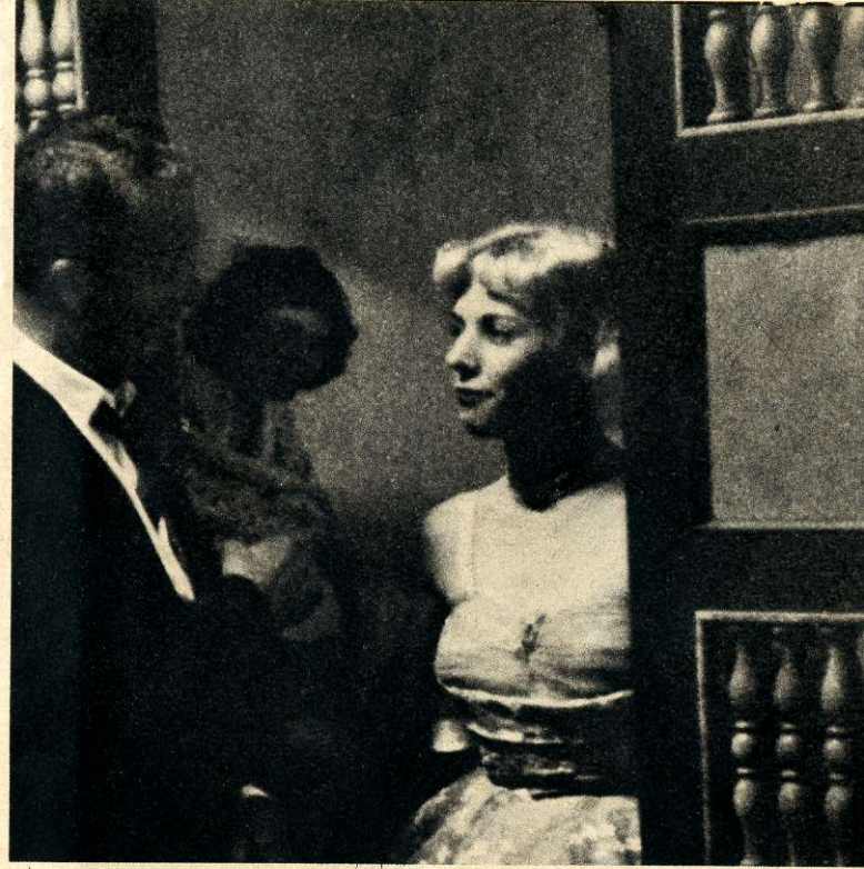
of the better-class "family houses" which cater only to "gentlemen."

open in Havana and any tourist is fair game for money-hungry panderers, crooked guides and pocketpicking streetwalkers. Of course, many tourists avoid the vice traps and can enjoy