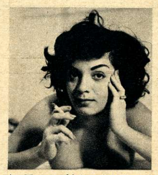
At 18, an old-timer at "love."

I could trust, and I found him waiting hopefully in the lobby of my hotel.