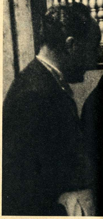
This pretty blonde worked in one

3. In restaurants and nightclubs of the less savory sort you will often find your checks padded, and sometimes discover that "fingermen" operating out