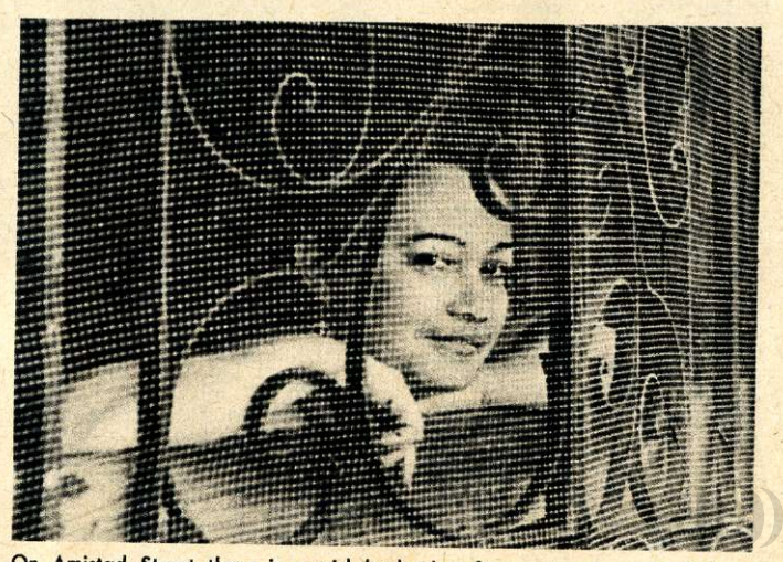
On Amistad Street there is a girl beckoning from every barred window.

without exception, beauties ranging in age from 17 to about 30. You could go to a private room with them, or just sit and chat or drink. All very civilized. Cost: about $25 if one stayed with a girl. Nothing, if you weren't a deadbeat, but just came to chat and look for a while. Drinks were about 75 cents apiece. Some of these houses were in a seaside suburb called Marianao, and if you wanted you